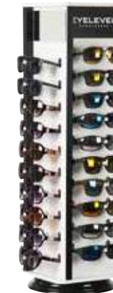
EYELEVEL COUNTER 40