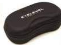
ZIP CASE MEDIUM