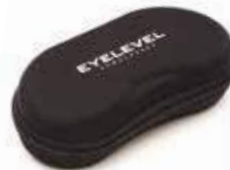
ZIP CASE LARGE