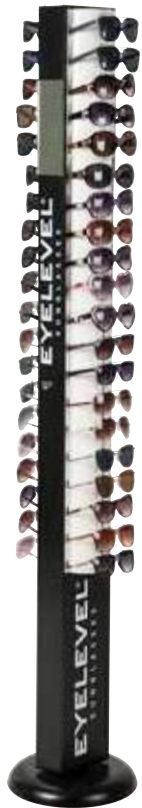
EYELEVEL FLOOR 40