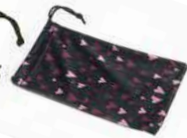
HEART PRINTED POUCH